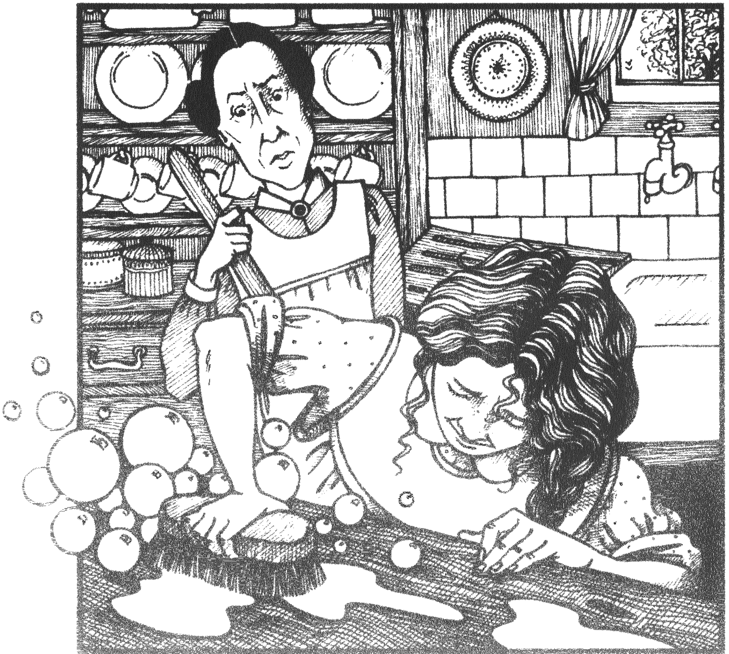
In the morning Anne helped Marilla with the housework.

When the two girls met, they knew at once that they would be good friends. They often played together, in the fields, or by the river, or in the garden. In the morning Anne helped Marilla with the housework. Then in the afternoon she played with Diana, or talked happily to Matthew while he worked on the farm. She soon knew and loved every flower, tree, and animal at Green Gables.