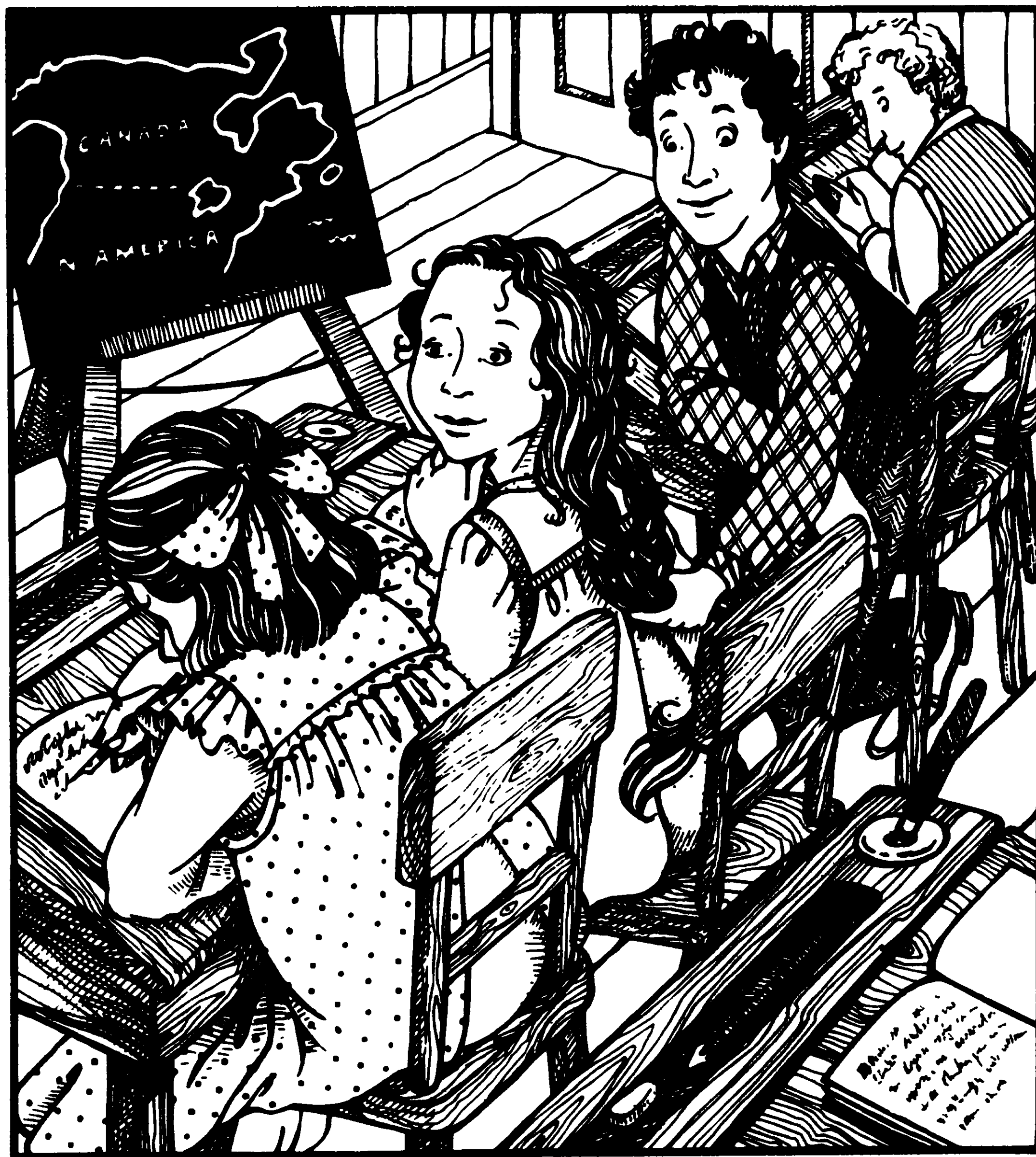
Gilbert put his arm out, and pulled Anne's plaits.

'You horrible boy!' she cried. 'I hate you!' And then she brought her heavy book down on Gilbert's head.