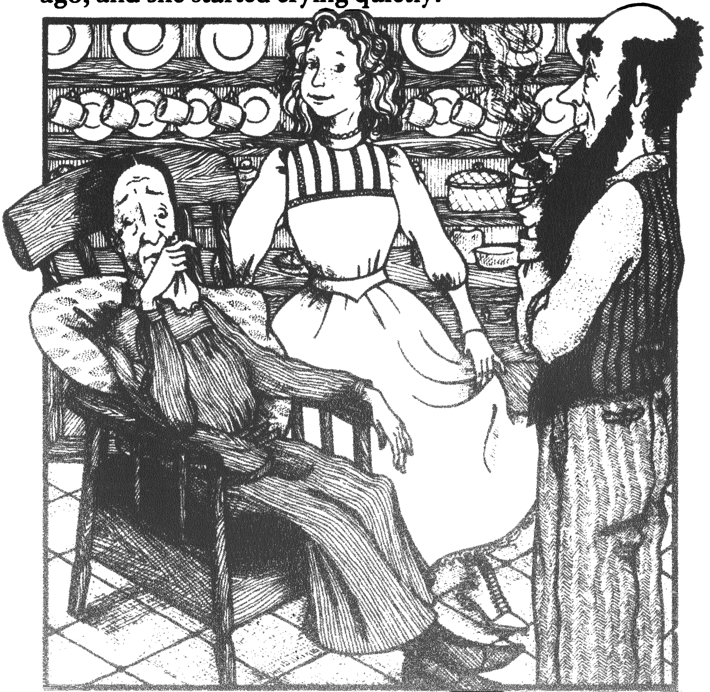
Anne put on one of her new dresses to show Matthew.

The evening before she left, she put on one of her new dresses to show Matthew. Marilla watched the happy young face. She remembered the strange, thin little child, with her sad eyes, who arrived at Green Gables five years ago, and she started crying quietly.