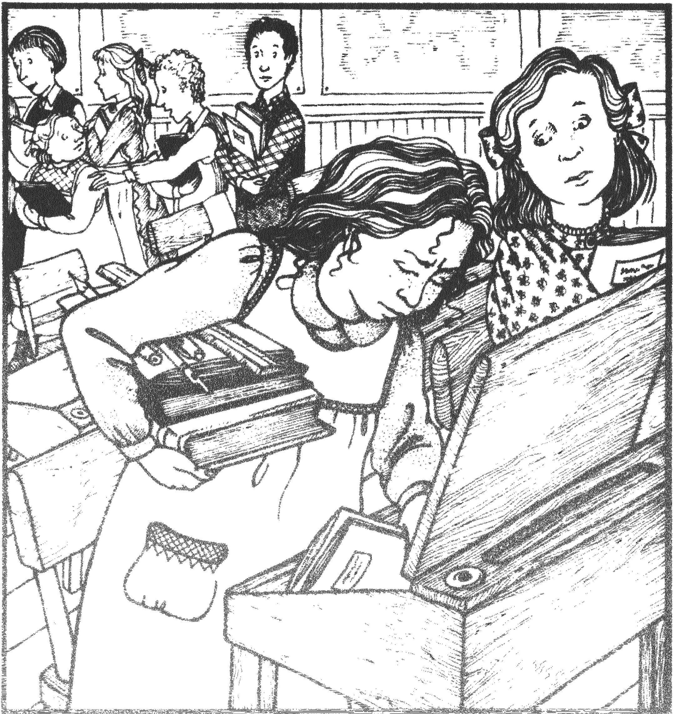
Anne took all her books, pens and pencils.

‘What are you doing, Anne?’ asked Diana.