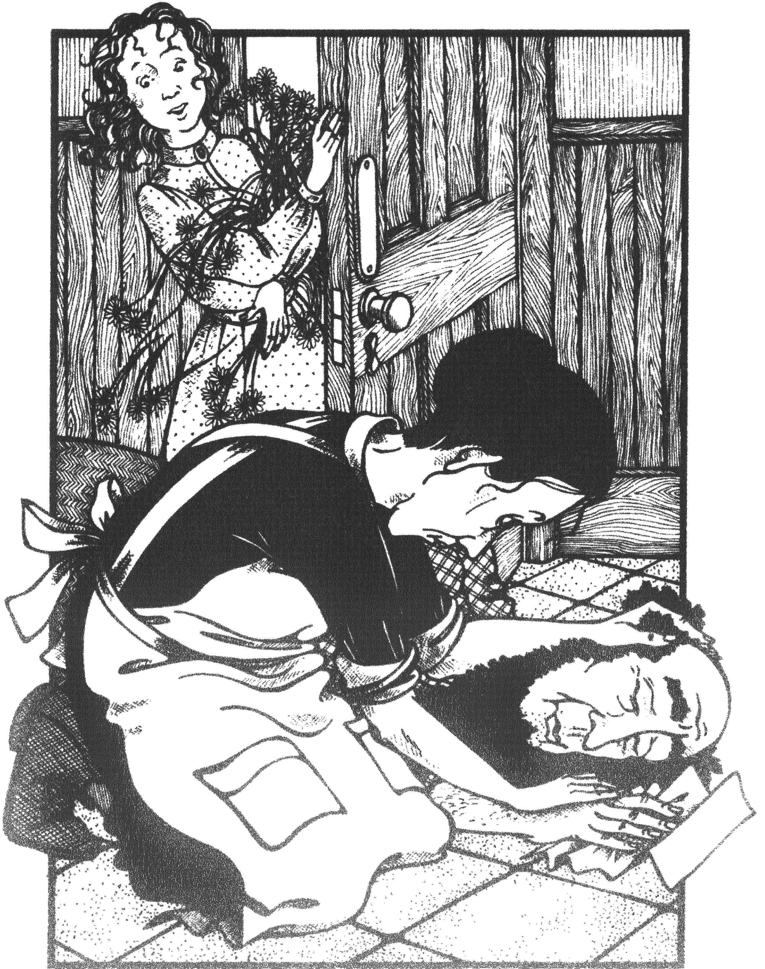
Anne dropped her flowers and ran to help Marilla.