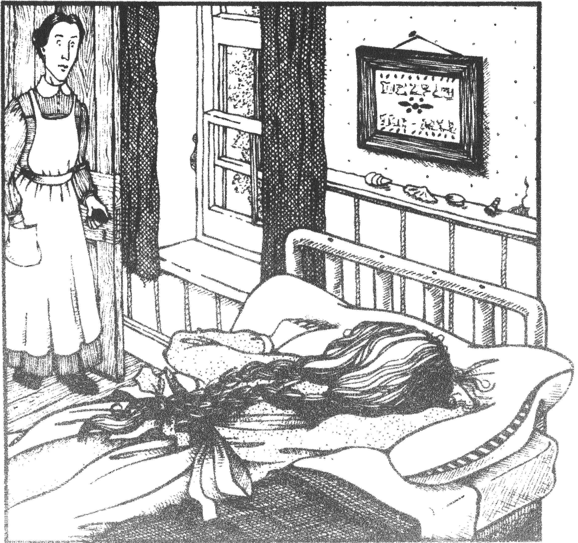
Anne was lying on her narrow bed, sobbing loudly.

'You mustn't get angry like that, Anne. Mrs Lynde is my friend, and you were very rude to her.'